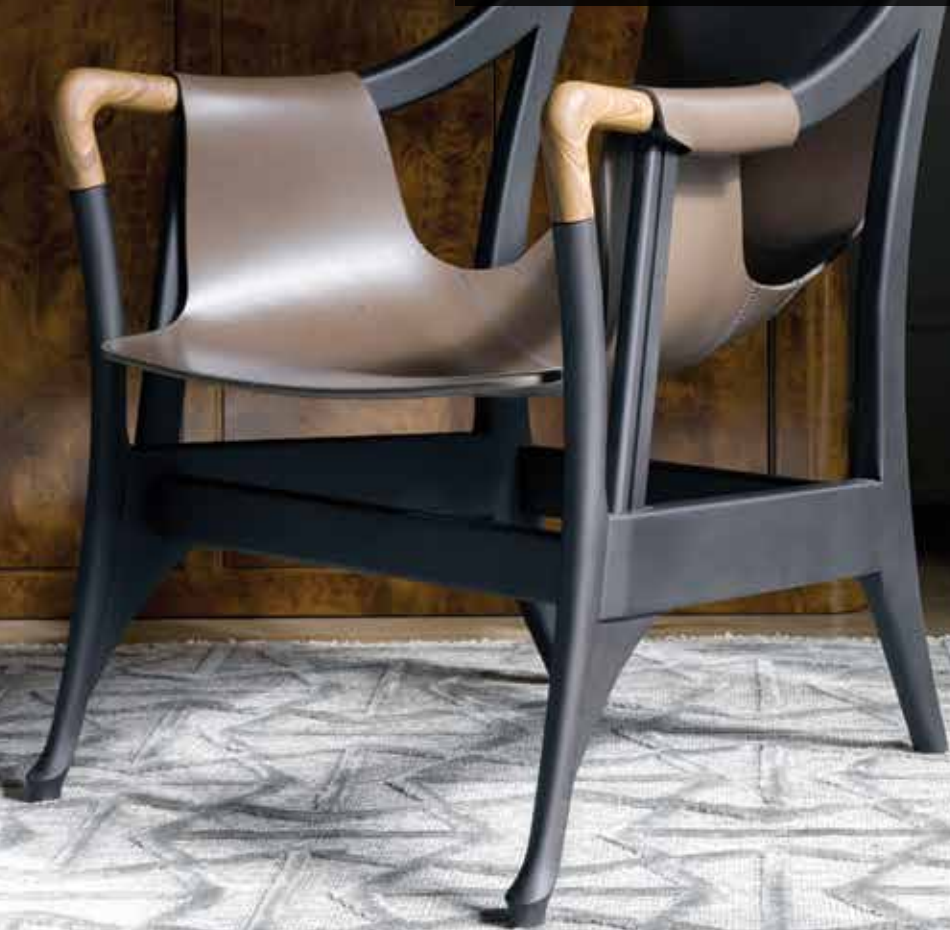
Indo Tess Inverse, Custom Smoke

Indo Tess Inverse is a celebration of contrast, deepening the observer's appreciation of its form. A coarse, flat woven field in wool, with every imperfection of the hand-weaver's art exposed, offset by the flickering play of light across dense and luxurious silk – such is the beauty of Tess.