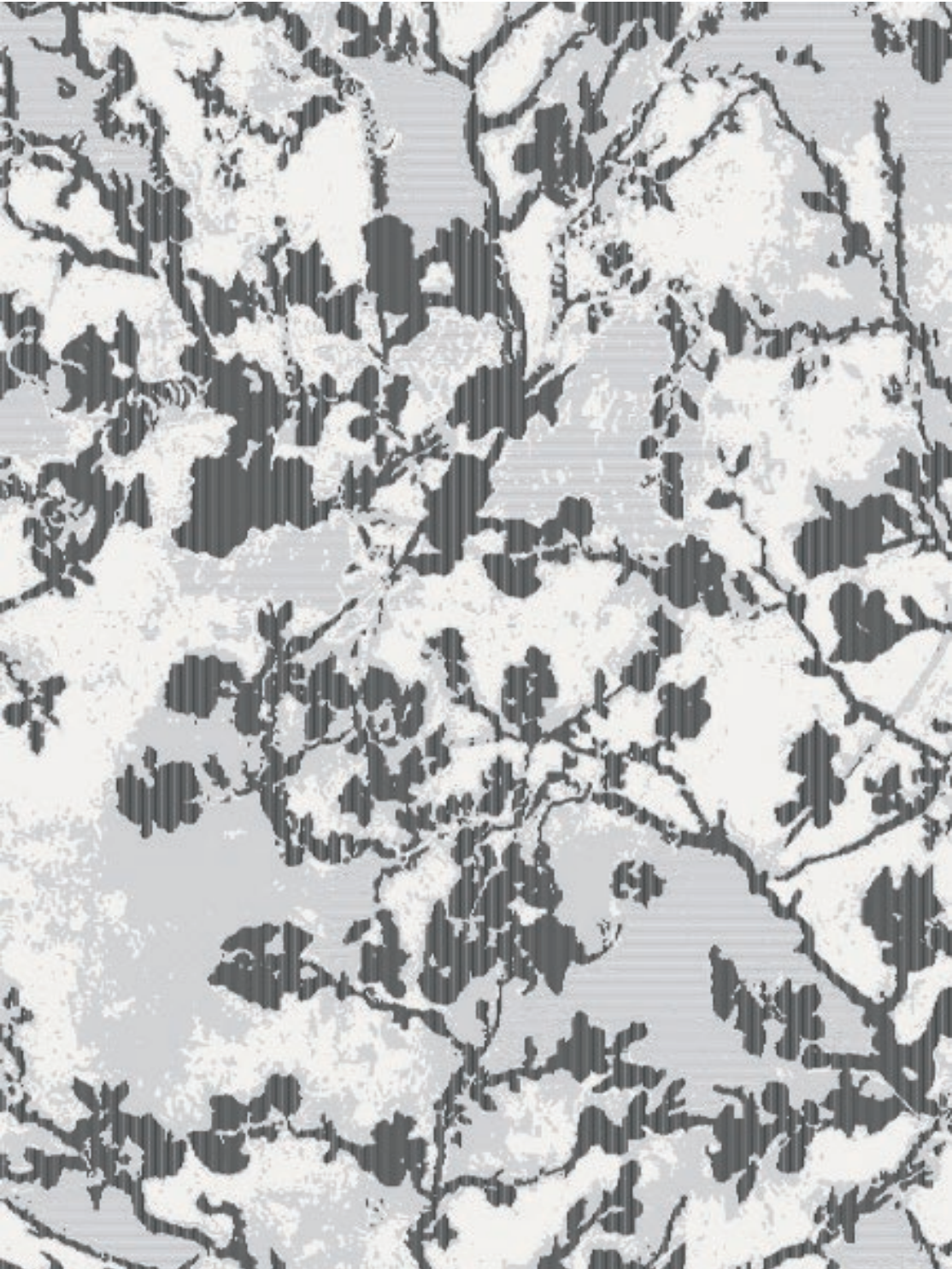
Full pattern rendering shown as 9x12' rug