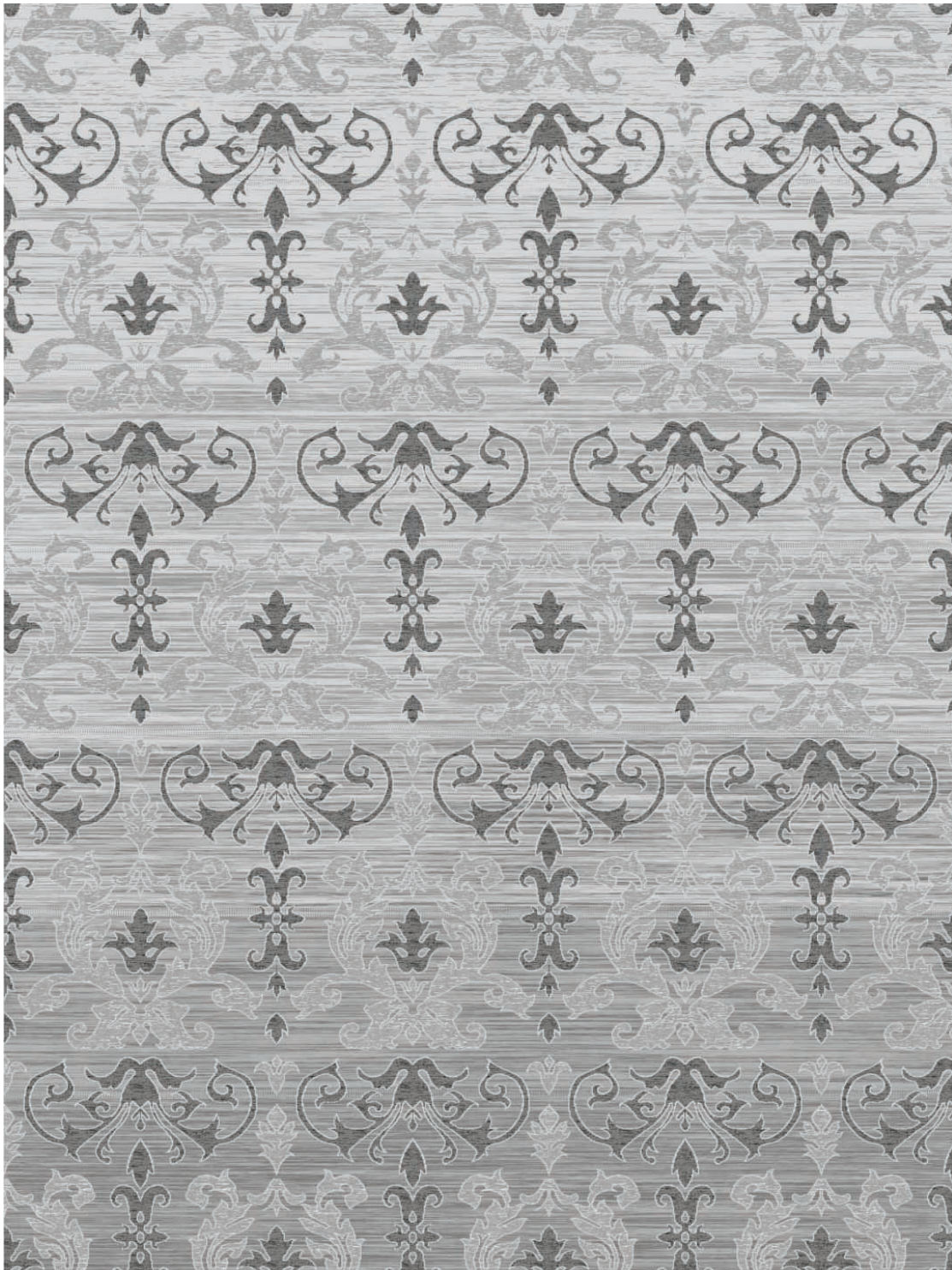
Full pattern rendering shown as 9x12' rug