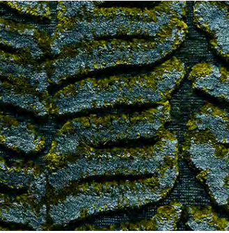
Photo of sample rug