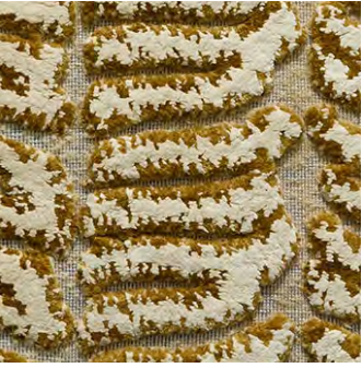
Photo of sample rug