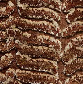
Photo of sample rug